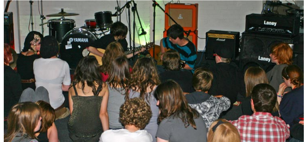
Likely Lads live, below

And finally Sabotage – no rest for the ears here as they drill the audience with double helpings of thickened bar chord thrash ending with the Star Wars theme – so, this was Underwired 18 punk extravaganza.