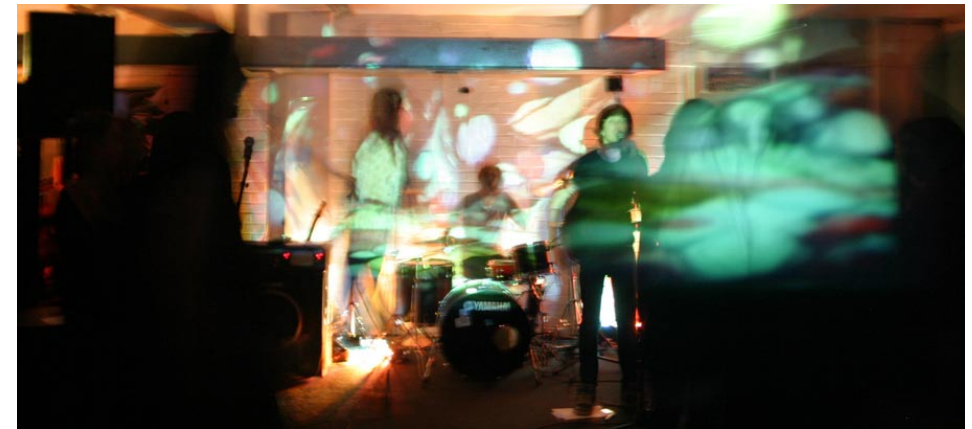
Manuscripts live, above

Work Experience Thanks to our work experience students, it has been a pleasure to work with such an enthusiastic group.